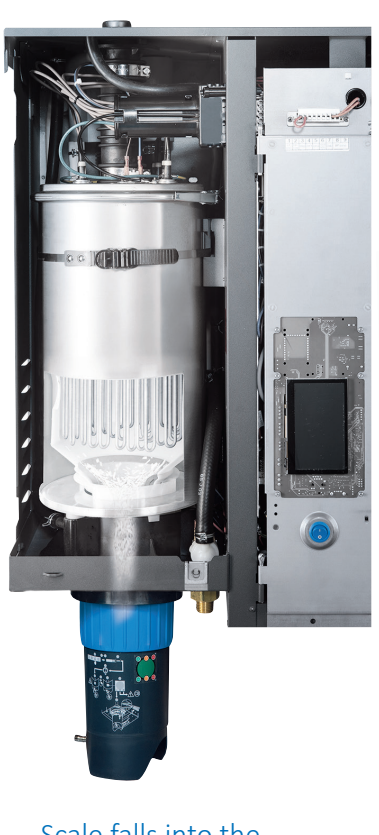
Scale falls into the scale collection tank