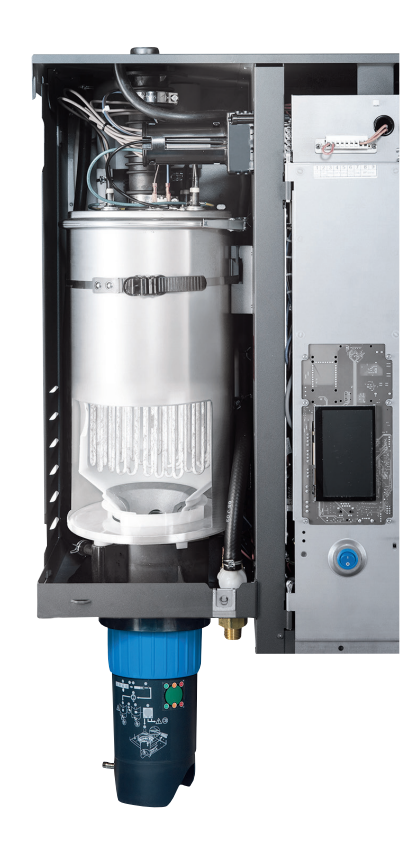
Scale forms on heating elements