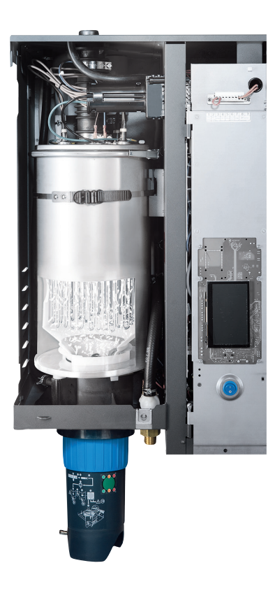
Scale detaches during heating cycles