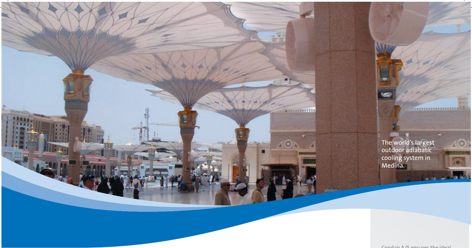
The world's largest outdoor adiabatic cooling system in Medina.