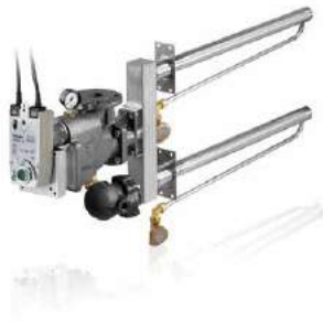
Condair ESCO Live steam humidifier Uses a building's existing steam supply, offering 5-2,000kg/h.