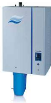
Condair RS Resistive humidifier No disposable cylinders, offering 5-160kg/h and \pm 5\% RH control or \pm 2\% with RO water.