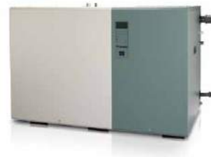
Condair SE Steam-to-steam humidifier Uses a building's impure steam supply to create pure steam, offering 23-475kg/h.