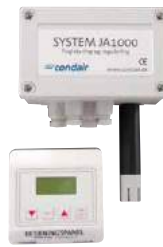
Controllers and sensors Control systems based on either %RH or dew point.