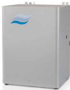
Condair RO Water treatment system for humidifiers.