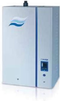
Condair EL Electrode boiler humidifier Easy to install and service, offering 5-160kg/h and \pm 5 to \pm 10\% RH control.