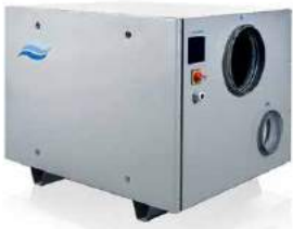
Condair DA Desiccant dehumidifier Ideal for drying at low temperatures or when low humidity levels are needed.