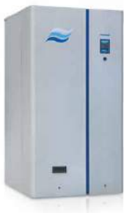
Condair GS Gas-fired humidifier Steam humidification with the operating economy of gas, offering 20-270kg/h.