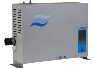
Condair RM Resistive humidifier Generates clean, mineral-free, sterile steam from 2-8 kg/h to an AHU.