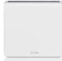
Condair DP Swimming pool dehumidifier A comprehensive range of dehumidifiers for small to large commercial pools.