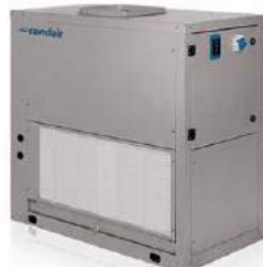
Condair DC Condensing dehumidifier Ideal for drying down to around 50%RH and at temperatures above 15°C.