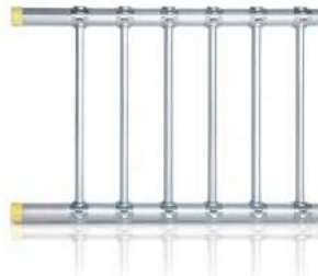
Condair OptiSorp Rapid evaporation steam distribution system.