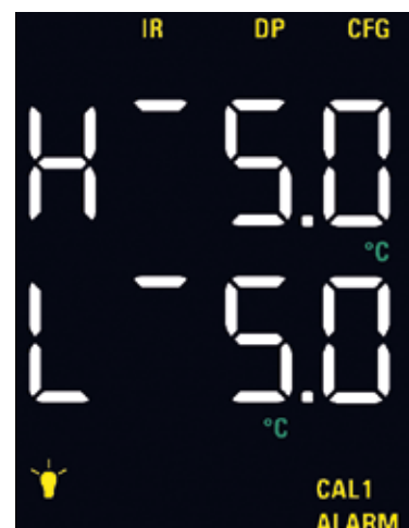
Dew point alarm configuration